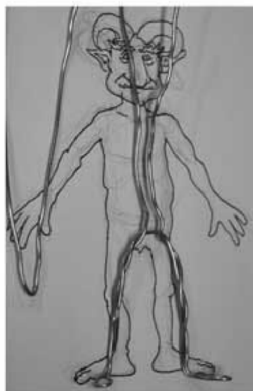
2. Twist legs, and get another piece ready to add to the spine.