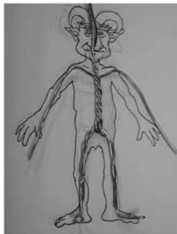
3. Twist 4 wires together for spine, with 2 for arms and two for head.