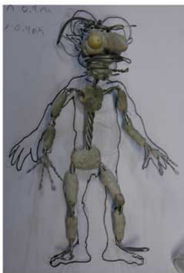
6. Press blank eye beads into the putty while it is soft to make shallow sockets. Add wire loops for eyebrows, ears, and lips. Here, the upper lip has a single loop, the lower lip has 3 loops for better mouth shaping. Choose one method for both lips.