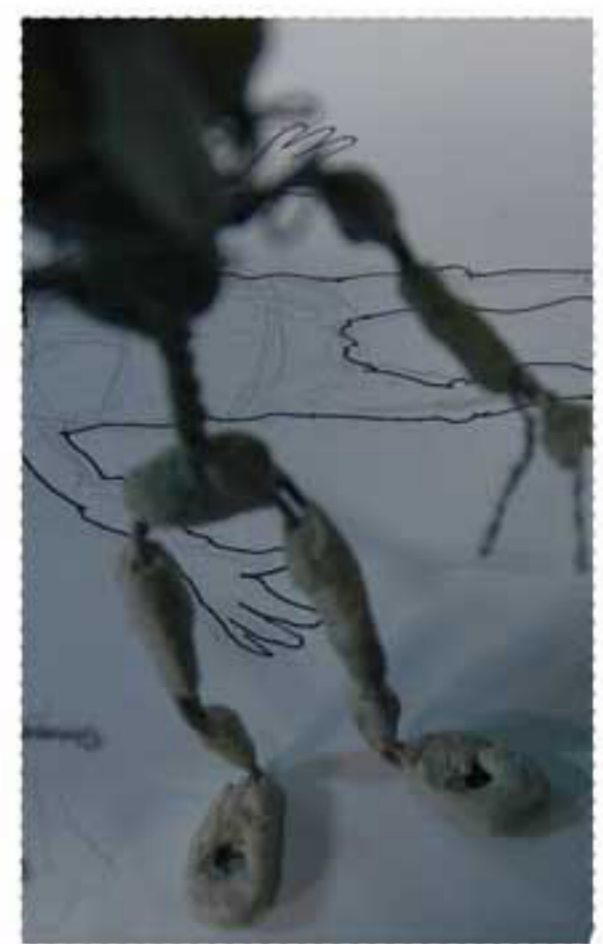
8. Cover the nut and the wire with epoxy putty to hold it in place. Now you have an armature. Time to move on to the next step.