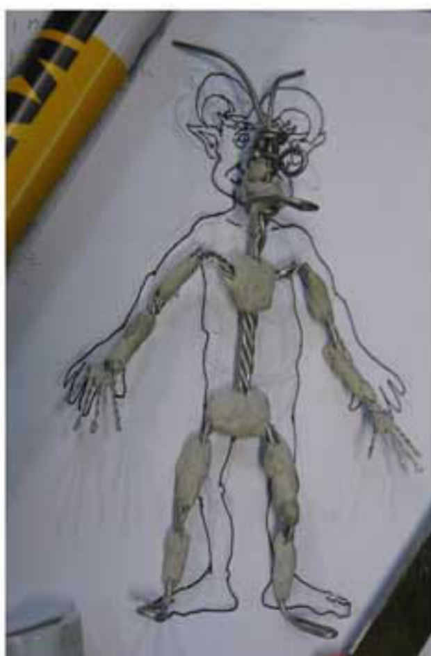
5. Knead together small amounts of epoxy putty at a time to cover the parts where the bones would be. Leave a big enough gap at the joints so the wire isn't forced to bend in one tiny spot. Build up the head with some wire.