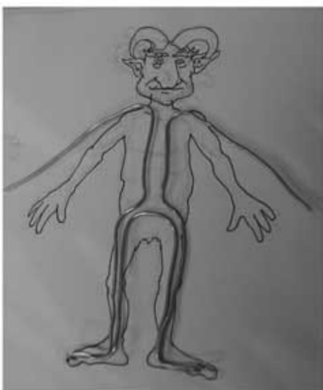
1. bend a piece of 1.5mm (1/16") wire to form arms, legs, and spine.