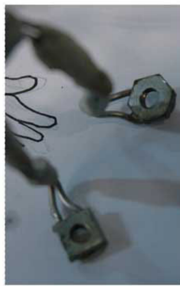
7. With 5 minute epoxy, glue a 3/16" half nut or square nut onto the top of each foot loop. This is for the tiedown which will support the puppet during animation.